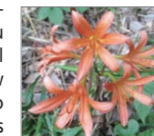
Red heart lily

☆We recommend you to start walking from the finish point of the course once in a while. You will discover something new and enjoy the course twice. In particular, if you walk from Yabo Tenmangu Shrine toward Joyama in Yabo, you will be very impressed by the stunning view of Joyama. It will be also interesting to stop walking and turn around sometimes to view the scenery.